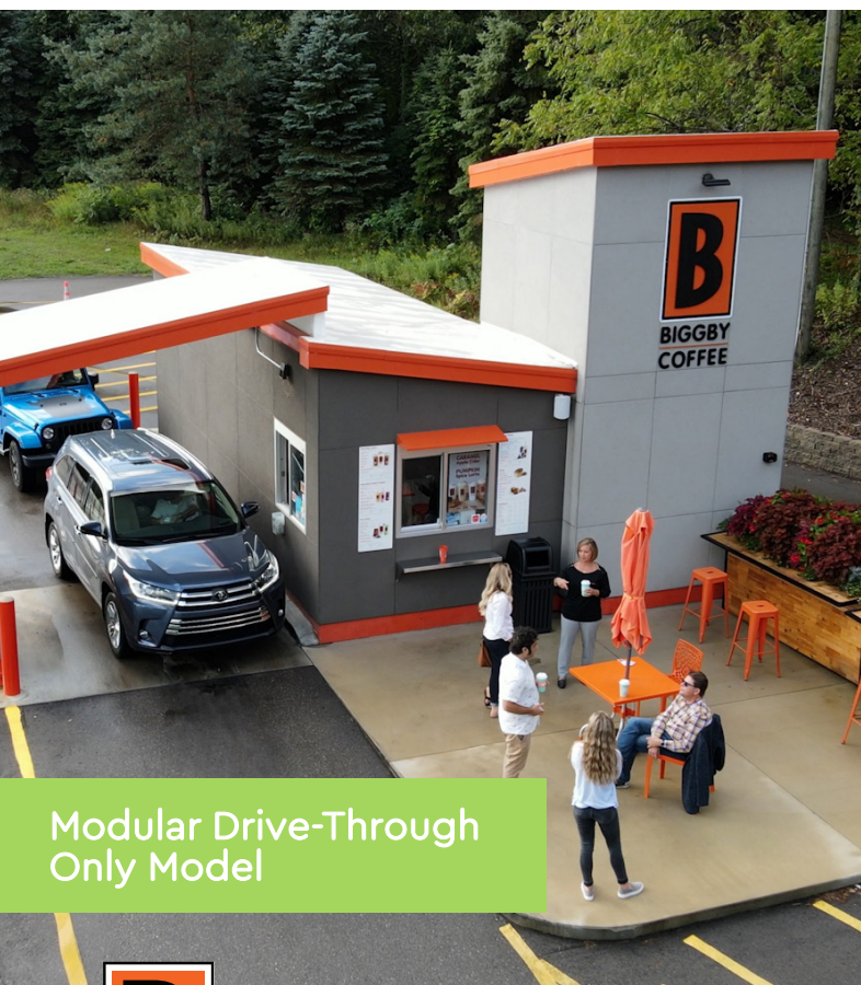
Modular Drive-Through Only Model

One of the reasons why BIGGBY® COFFEE is growing is because we've developed revolutionary business models for every setting, from high-end strip centers, to freestanding buildings, to non-traditional locations such as hospitals, travel plazas, airports, and college campuses. Most recently, we launched our a modular location which is a prefabricated building with a drive-through only. This model is unlike anything else in the coffee shop industry.